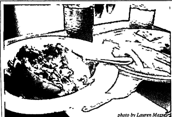
Commons is trying to offer healthier options. See story, page 4