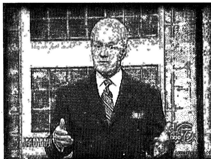
Alex Trebek chose the Korner Pub over Jeopardy: Davidson Style.

Following an atrocious debut for Jeopardy: Davidson Style, matters did not improve much in the second installment.