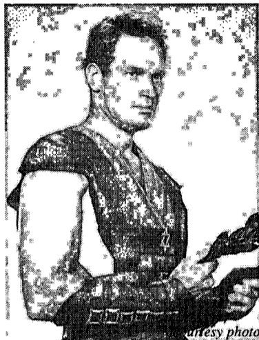
Charleton Heston moderated the college's first anti-gay panel.

Moderated by Chuck Norris and Charleton Heston, Tuesday's homophobic forum in the Union 900 Room proved to be one of the most pleasantly cheuvanistic and single-minded experiences in recent memory.