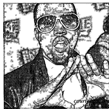
Kanye will not be taking shit from Michael Vick in prison.

British singer Amy Winehouse was discovered last weekend while attempting to cross the United States border en route to the 2008 Grammy Awards. Denied a visa earlier this month, Ms. Winehouse was discovered in the trunk of fellow Grammy nominee Kanye West's yellow Hummer.