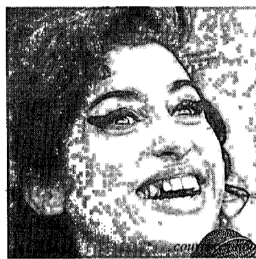
This jail-bound toothless wench had plenty to be wistful about.