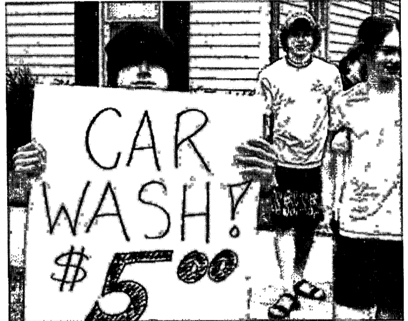
Students prepare for Saturday's fundraiser in front of Smith House.