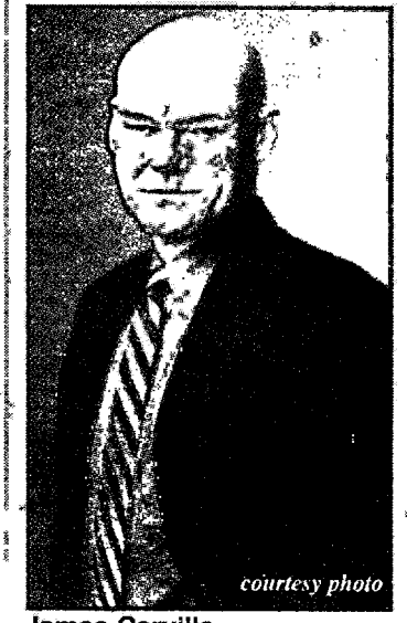
James Carville