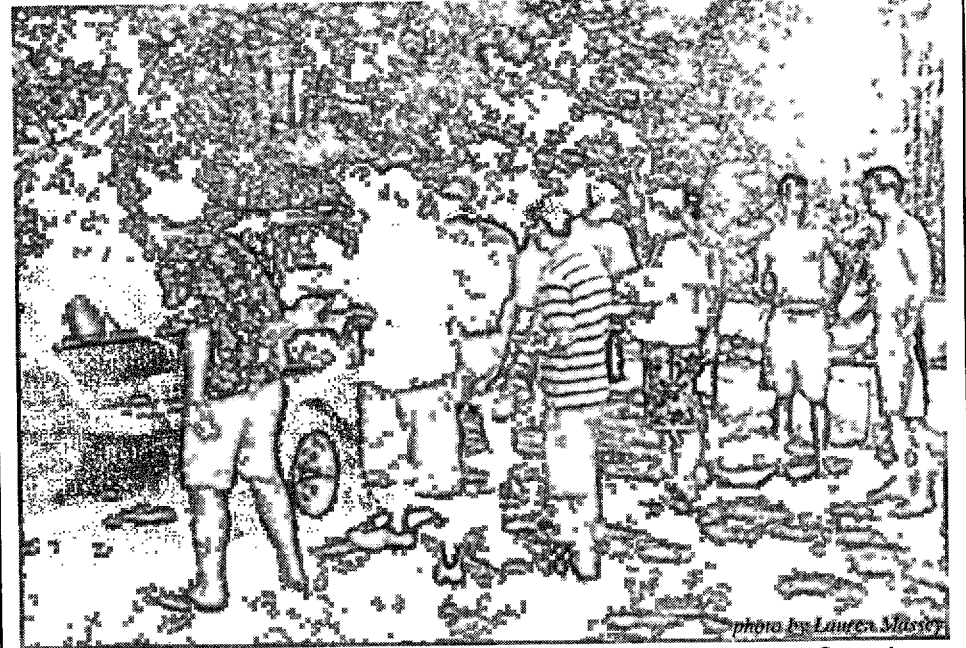
Students enjoyed the sun and a free cookout at April at the Lake on Saturday.

"We're trying to make sure everyone knows what [the theme] is so that when August arrives students can be willing to