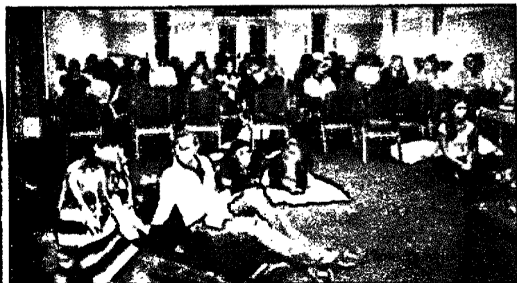
Freshman girls watch "Legally Blonde" for the Bean Bag Series.

The Admissions Office will sponsor Decision Davidson, which allows admitted students to visit Davidson before finalizing their college plans., on April 8.